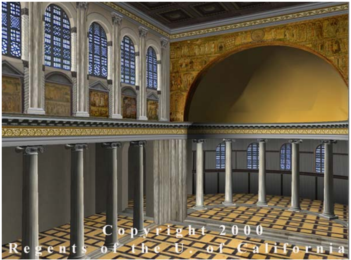
Fig. 6. View of the final version of the semidome of the apse and of the floor.

Viewers can examine the VR model from any angle. Such multiple viewpoints immediately compelled an interest in the building's overall urban setting and topography. The Scientific Committee believed the form of the building could not be understood without recreating the surroundings. Unfortunately, information about the topography of Rome in the fifth century is limited. Drawing upon nineteenth-century excavation data, the team located spot points and analyzed the current state of the hill to recreate a topographic map of the area in late antiquity (see fig. 7). The model of the Cispian Hill's northwest slope, along with the appearance of the basilica model, compelled the Scientific Committee members to rethink the reconstruction of the apse end of the building; in response, they recommended removing the buttresses originally modeled around the exterior of the deambulatory of the apse in emulation of the church of S. Agnese in Rome.