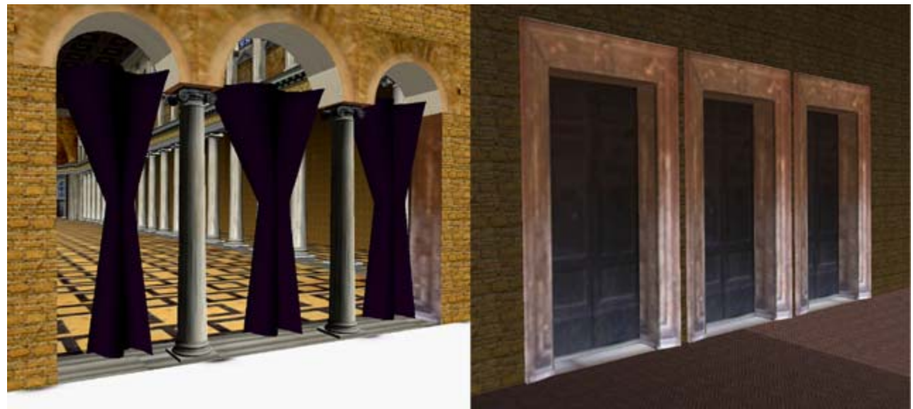
Fig. 4. Alternative reconstructions of the front entrance of the Basilica of Santa Maria Maggiore (left: curtained openings of final version. Right: doors in an earlier version).

Traditionally, reconstructions of historic buildings have been executed as 2D drawings of selected views or as simplified three-dimensional models. Both are static forms which can be altered only with great difficulty. With VR technology, the recreated building is constructed in 3D but is also 4-dimensional, since it can be experienced temporally. Viewers can move through the structure in real time, or see a modeled building evolve over time. A VR model is not static, allowing for several simultaneous versions and repeated updates. This flexibility allowed the Rome Reborn team to model new or conflicting interpretations, layer different building phases and test various hypotheses. For example, since scholars do not agree about the treatment of the entry into the nave, the team modeled the building entry with both a trabeated door and an arcuated, curtained opening (fig. 4).