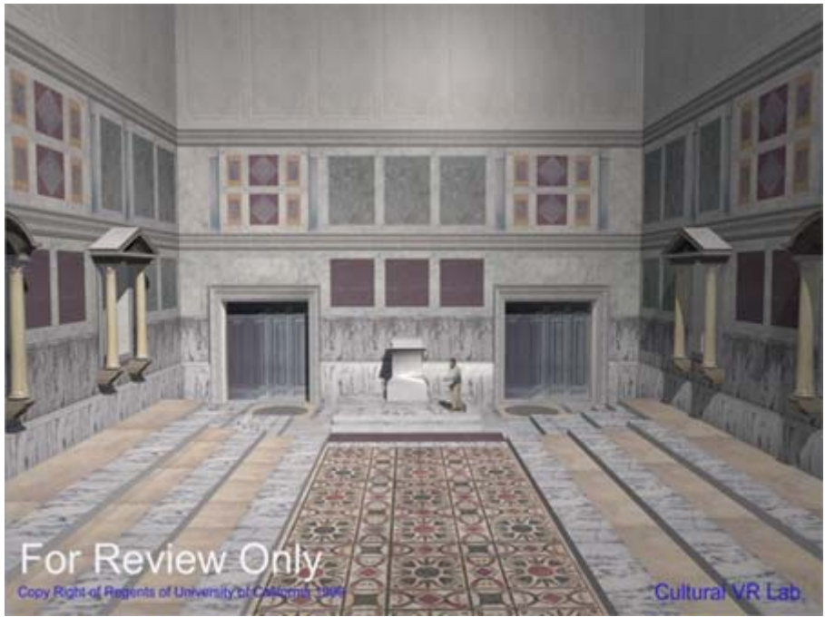
Fig. 1. A view of the interior of the model of the Roman Senate House in the Roman Forum produced by the UCLA Cultural VR Lab for the Rome Reborn Project

The Lab's mission is to provide technology support for projects like Rome Reborn that strive to recreate authenticated three-dimensional computer models of sites of great historic and cultural interest around the world. The Lab was founded on the assumption that in the next few years it will be as usual for archaeologists to commission highly accurate 3D computer models of their sites as it is for them to order radiocarbon dating of their organic finds or other tests. Just as there are several laboratories commonly used for radiocarbon dating, it is logical to expect that there will be a handful of 3D modeling facilities known for providing this new kind of archaeological service. The UCLA Cultural VR Lab hopes to be one such service provider.