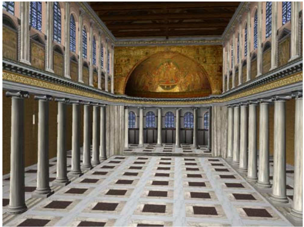
Fig. 5. View of the interior of the Basilica, with the first version of floor and the extant thirteenth century mosaic in the semidome

importance when seen in the 3D context of the model. Thus, at first the Scientific Committee was not overly concerned with the interior pavement, yet the powerful visual impact of the floor on the perception of the entire basilica soon demonstrated the significance of this feature (fig. 5). Several different pavements were tested and the impact of the colors, textures, and pattern size on the overall visual experience carefully evaluated. The final choice was based on a roughly contemporary floor pattern from the Basilica of San Giovanni in Laterano (see fig. 6). In a few instances, visual intensity became an issue.